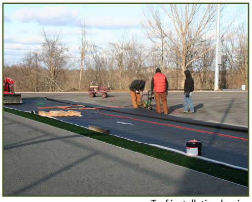
Turf installation begins