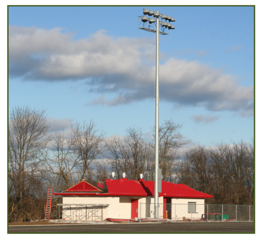
Concession stand, restrooms and storage

At this time, construction costs total under $2.4 million. Overall, we have seen a cost savings of more than $111,000 on this project due to conservative planning and changes to the project that lowered the overall costs. In addition, we were also able to provide for 20 additional parking spaces between the High School and Pleasant Valley Elementary, as well as paving of the road leading from the High School to Pleasant Valley.